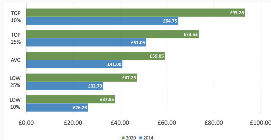
COST OF ENERGY PER PRIMARY SCHOOL PUPIL